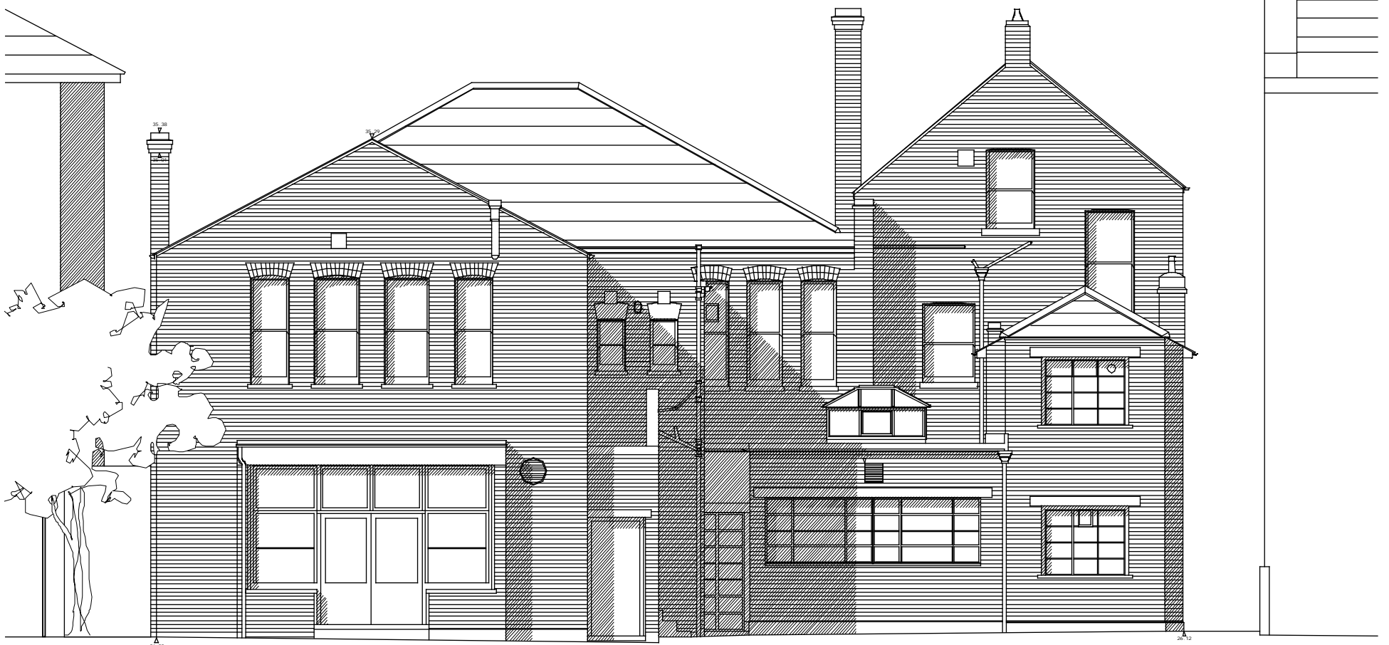
1 FRONT ELEVATION 103 Scale 1:50